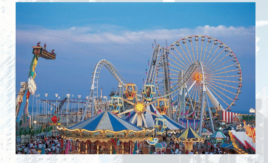
Entertainment / Theme parks